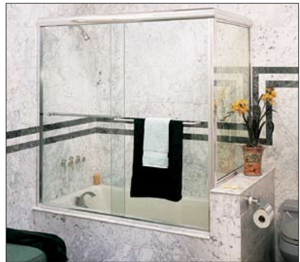
CT-636-B Sliding Tub Enclosure with Butress Return Panel

Satin Nickel Aluminum, 1/4" Clear Glass 6" C-Pull Handle