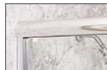
Round header for Centec slider models