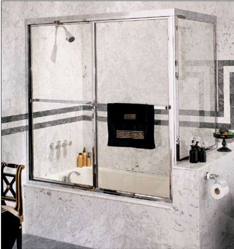
B-636B Corner Tub Enclosure with Buttress Return 1-1/4" Frame, Polished Chrome, Clear Glass

Superior workmanship and elegant design are unmistakable in these beautifully hand-crafted enclosures. Brassline quality, durability and good looks are truly one of a kind.