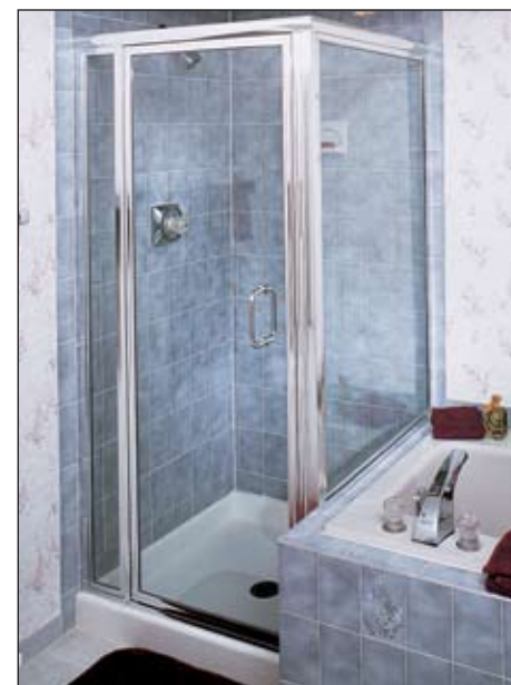
L-1631-B Corner Enclosure, Silver Anodized Aluminum, Clear Glass 6" C-Pull Upgrade