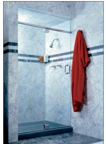
GP-1627 Door & Panel with Transom Panel, Chrome Plated Brass, 3/8" Clear 90° Glass, 6" C-Pull Handle