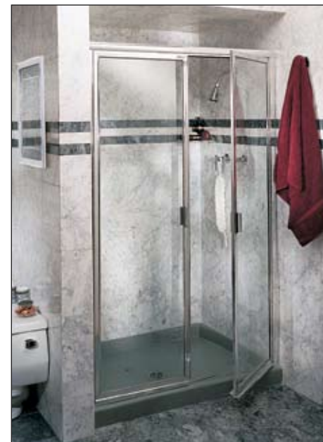
L-1629 French Doors Satin Nickel Aluminum, Clear Glass