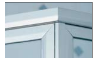
1/4" frame, flat beveled header for hinge models