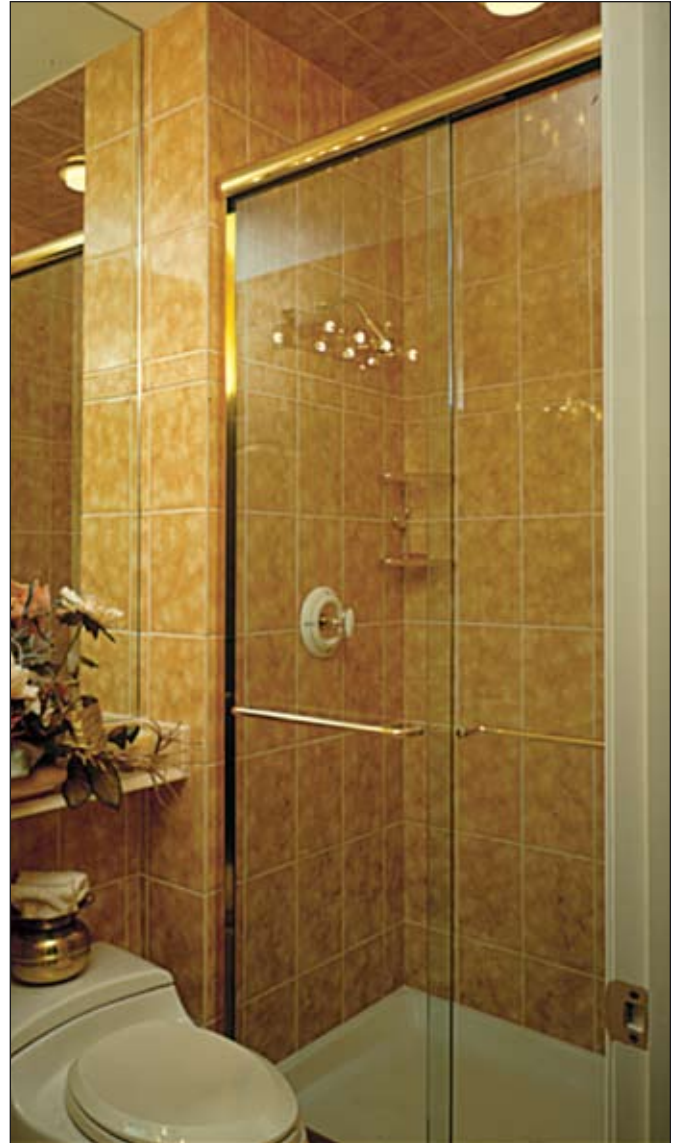
G-CS Sliding Stall Enclosure with Standard Round Header, 24K Gold Plated Brass, 3/8" Clear Glass, Modern Towel Bars