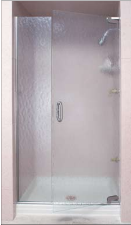
GAPW-1627 Door & Panel with Wall Channel, Satin Nickel, 3/8" Bubble Glass 6" C-Pull Handle