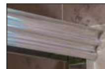
Optional crown header for Centec slider models