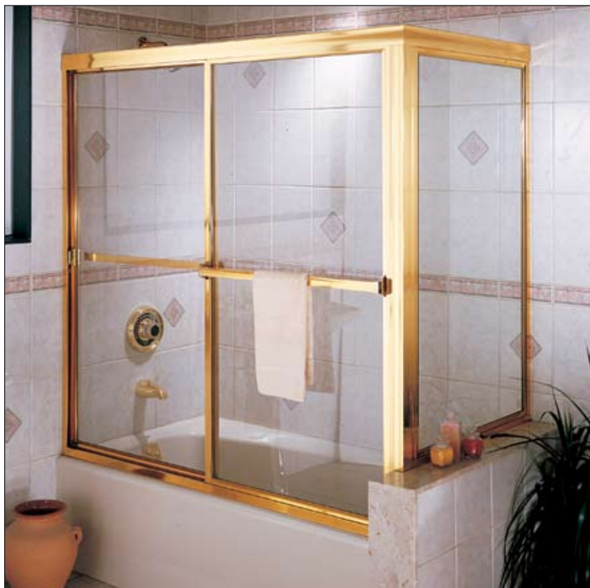
L-636-B Sliding Corner Tub Enclosure Gold Anodized Aluminum, Clear Glass

High quality aluminum makes the Lucette series the perfect choice for a custom look at a great price. Fully framed sliding and hinged enclosures provide dependability while adding elegance to any bath decor. Over 18 finishes or custom paint to match, 15 glass options, and multiple hardware options guarantee the perfect style for you.