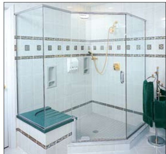
GP-1669 Custom Neo-Angle Polished Chrome, 1/2" Clear Glass, 6" C-Pull Handle