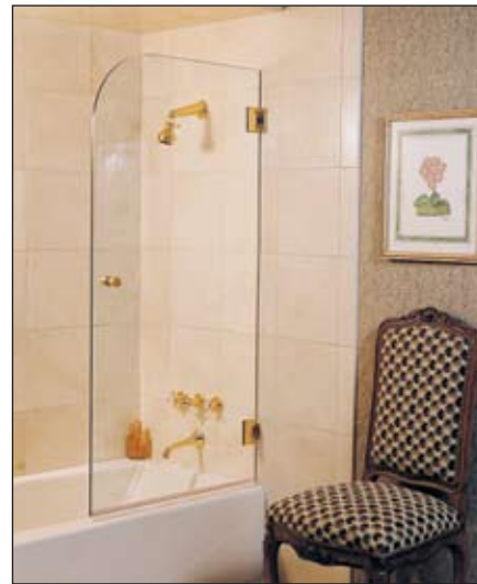
GWS-100 Hinged Spray Panel