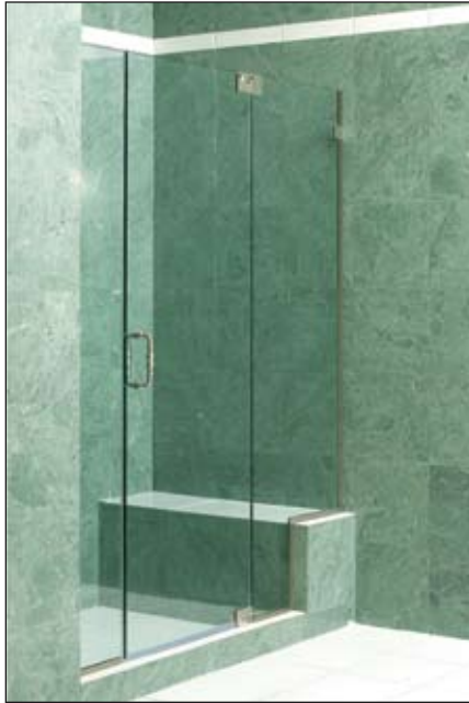
GGP-1628 Panel, Door, Notched Buttress Panel with Wall Clip and Channel, Satin Nickel, 3/8" Clear Glass, 6" Spindle Handle