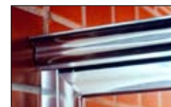
Upgrade Crown Header for Hinge Models