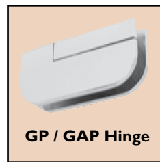
GP / GAP Hinge