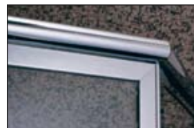
1" frame, round header for hinge models