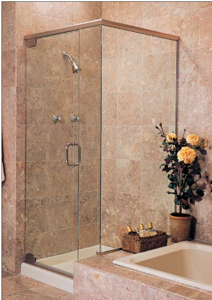
GAP-1631B Corner Enclosure w/ Buttress Satin Nickel Aluminum, 3/8" Clear Mitered Glass 6" C-Pull Handle