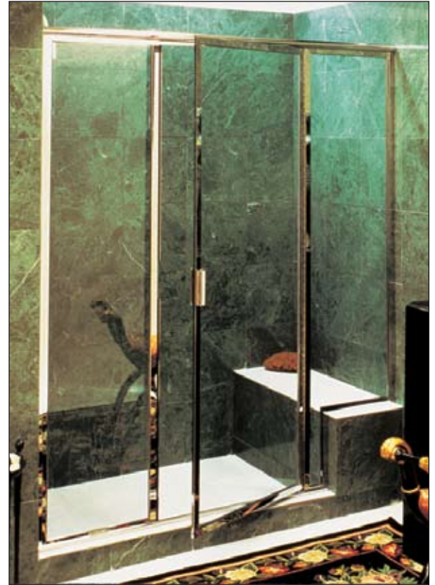
B-1628B Panel, Door, Notched Buttress Panel 1" Frame, Polished Nickel, Clear Glass