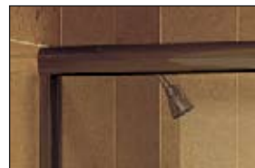
1" frame, round header for slider models