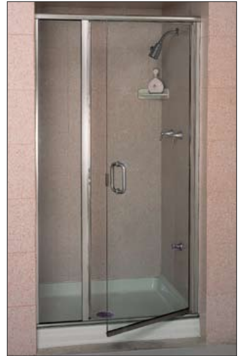
CH-1627 Door & Panel

Silver Anodized Aluminum, 1/4" Clear Glass, 6" C-Pull Handle