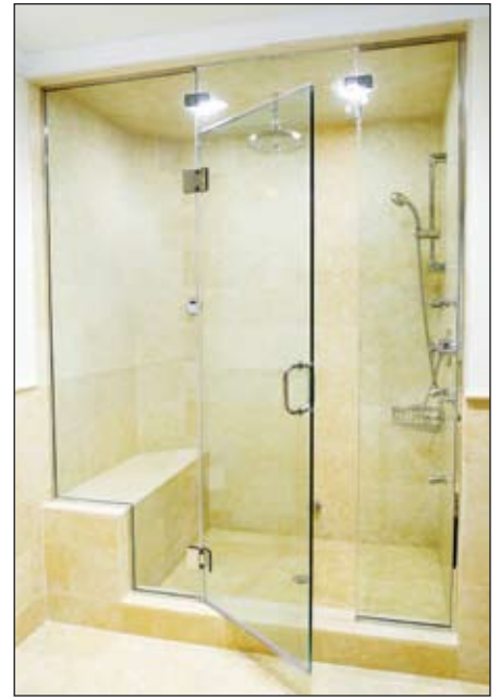
GG-1628B Panel, Door, Notched Buttress Panel, GCGGV Clamp Glass to Glass Vent and Wall Channels Polished Nickel, 3/8" Clear Glass 6" C-Pull Handle