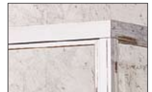
1/4" frame, flat beveled header for slider models