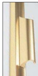
Standard Hinged Door Handle