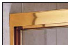
Lucette Slider Header