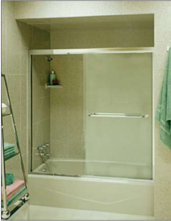
G-CT Sliding Tub Enclosure with Optional Flat Header, Satin Nickel Plated Brass, 3/8" Mist Glass, Modern Towel Bars