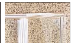
Round header for Centec hinge models