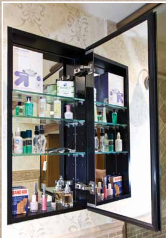
1930-6-BL-B-O-R-O with 6" Mirror Side Kit • 19" Wide, 30" High, 6" Deep Black Finish, Beveled Mirror, Hinged Right

CUSTOM SIZES AND COLORS AVAILABLE. CONTACT YOUR LOCAL DEALER FOR INFORMATION.