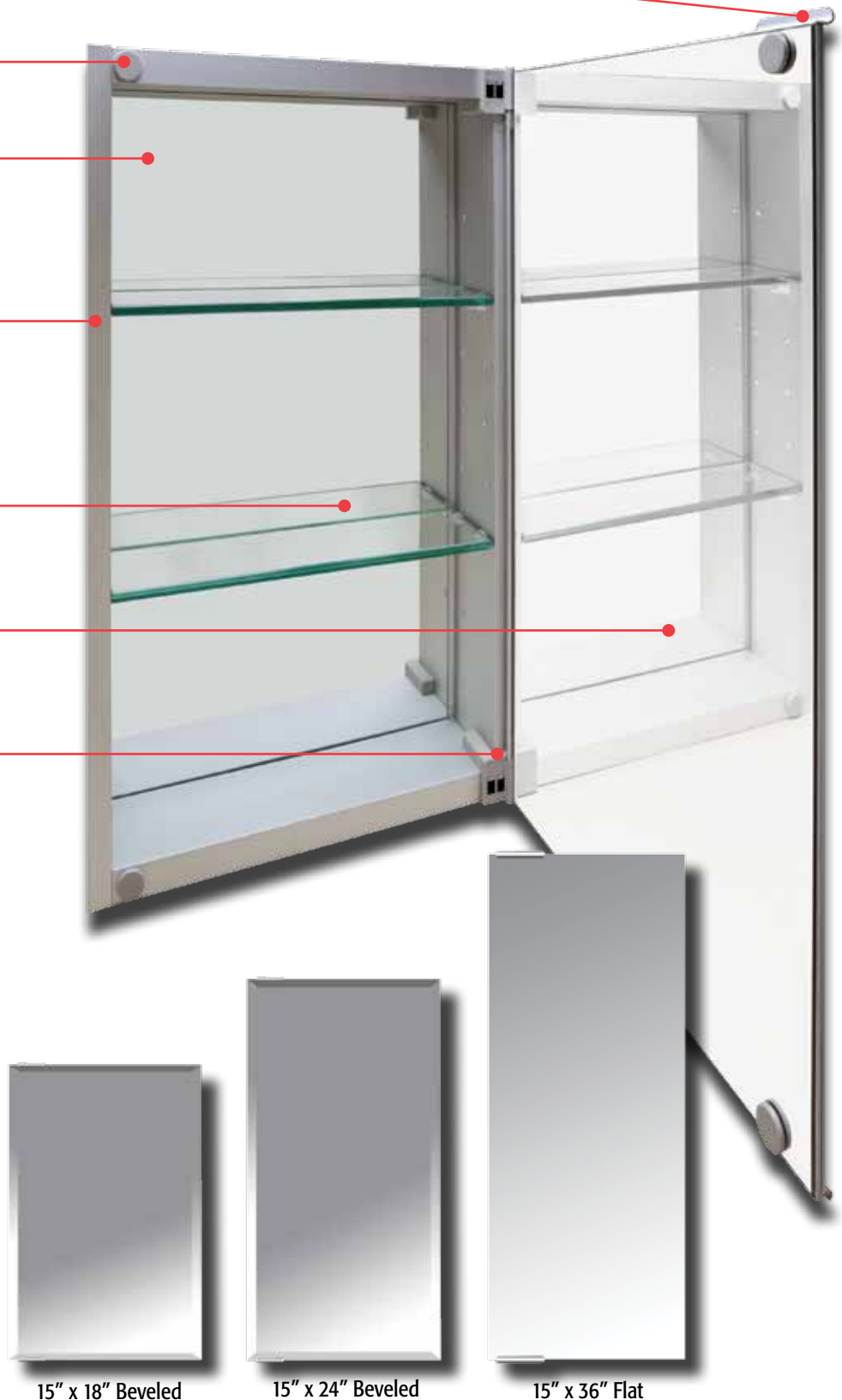
15" x 18" Beveled

All holes are pre-drilled and threaded. Doors are packaged separately for safe handling and ease of cabinet installation, and install in minutes.