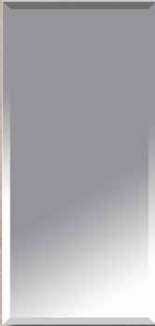
1530-4-SF-B-O-O-O 15" Wide, 30" High, 6" Deep, Satin Finish, Beveled Mirror, Hinged Right

Electric cabinets include a two outlet strip inside the cabinet and anti-fog door mirrors