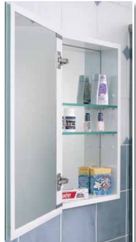
1524-4-WH-B-O-L-O 15" Wide, 24" High, 4" Deep White Finish, Bevel Mirror, Hinged Left