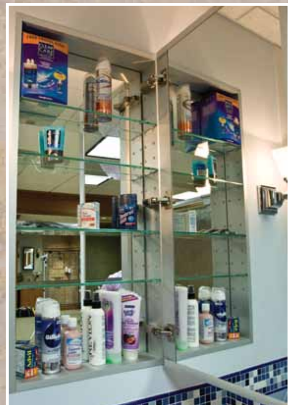
1930-6-SF-B-O-R-O with 6" Mirror Side Kit • 19" Wide, 30" High, 6" Deep Silver Finish, Beveled Mirror, Hinged Right