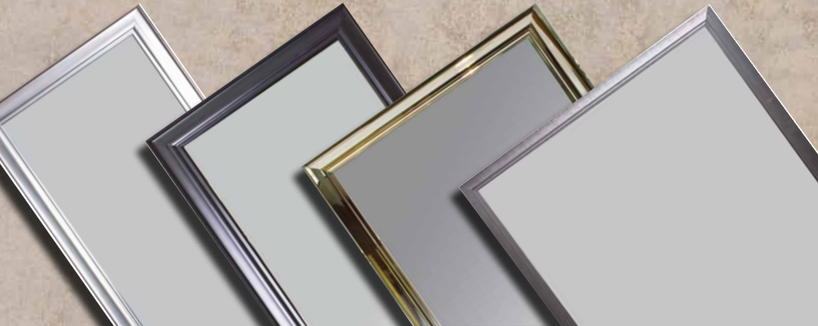
3/4 Transitional Frame Satin Nickel Finish 23 x 40 Medicine Cabinet