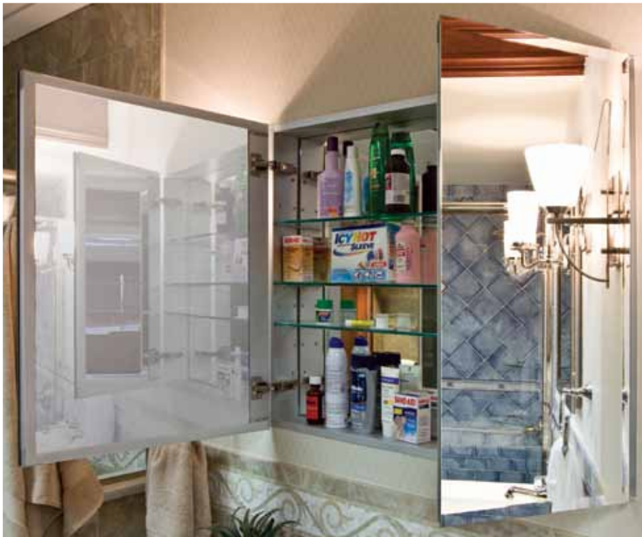
CUSTOM CABINET 30 x 36, 4" Deep Satin Finish, 2 Offset Beveled Doors